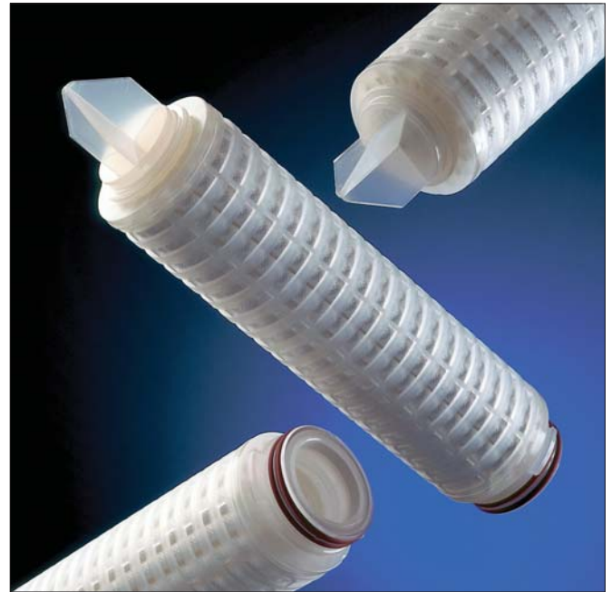
Profile Star Filter Cartridges

Please refer to the Pall website www.pall.com/foodandbev for a Declaration of Compliance to specific National Legislation and/or Regional Regulatory requirements for food contact use.